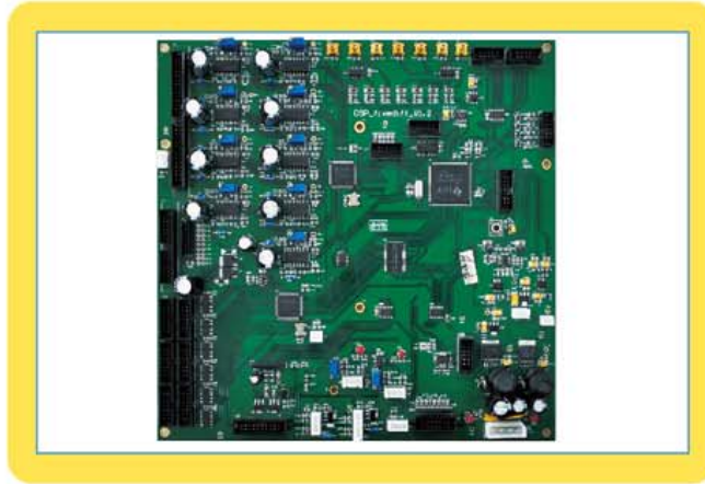
■ High-tech electronic measuring system.