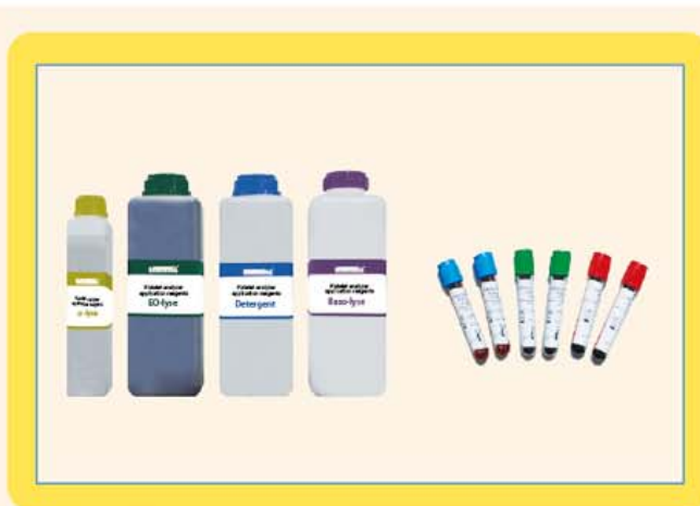
■ Calibrators, controls and reagents.

2728 S. La Cienega Blvd., Los Angeles, CA 90034 www.labomed.com spectro@labomed.com